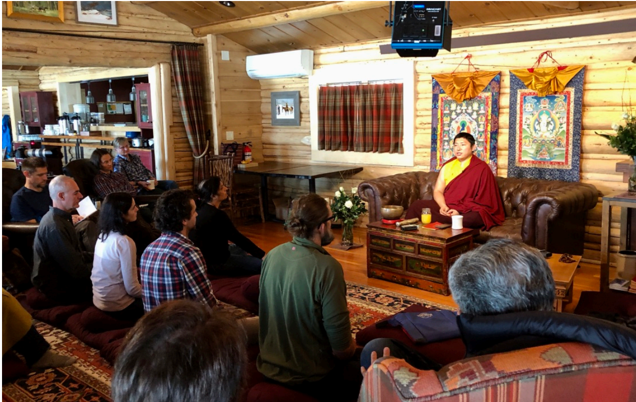
The Medicine and Compassion Retreat in 2017

writing about medicine and compassion for the past nineteen years. This retreat is the only one in the world, to our knowledge, in which a Tibetan lama teaches directly and exclusively to medical professionals about compassion.